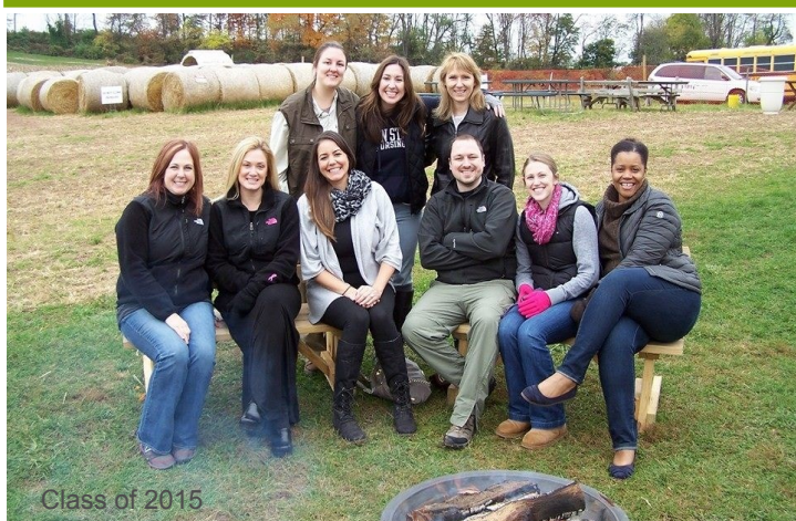
Class of 2015